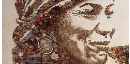
Detail from The Gypsy Magna – Pictures of Garbage By Vik Muniz