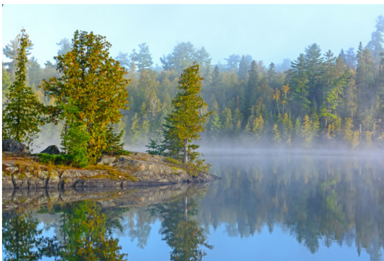
“Minnesota’s Boundary Waters.” World Book Student . World Book, 2016. Web. 8 Mar. 2016.

405 S Main Street | Bentonville, AR 72712 | 479.271.3192 www.bentonvillelibrary.org | library@bentonvillear.com