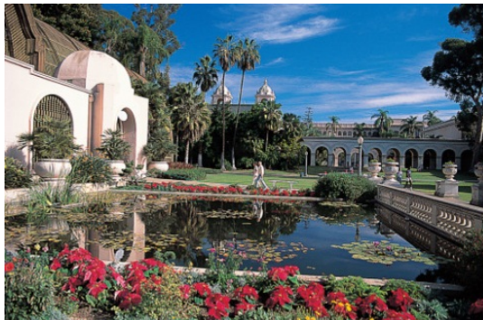
"Balboa Park, San Diego" World Book Student . World Book, 2016. Web. 23 Mar. 2016.

"Zoo." World Book Kids . World Book, 2016. Web. 23 Mar. 2016.