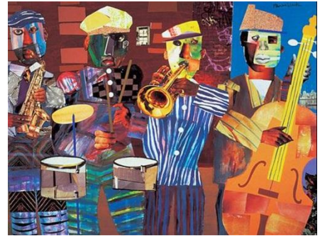
Jazz Village by Romare Bearden

5. Gluing will be their last step. This project would make a great exhibition as each child writes a short story about their collage to display along with their artwork.